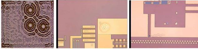
Fab Flop or Great Art?